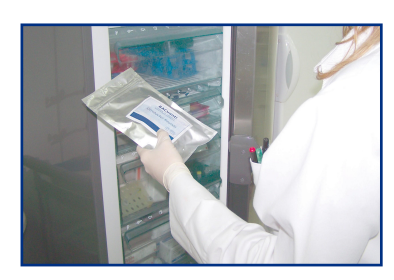
2 Keep it in the freezer at -20±5°C.